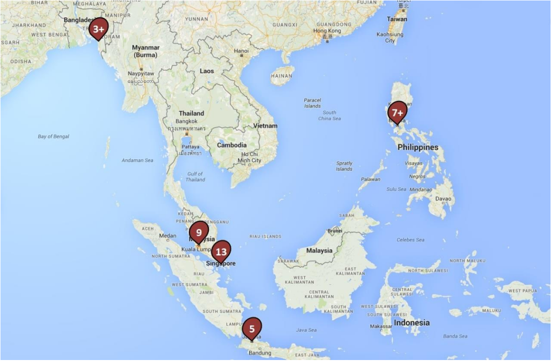
NOTE: Additional Nipah cases possible in the Rohingya refugees and US Navy Sailors.

In addition to the ongoing surveillance and response efforts, the USS John Finn—part of CTF 153 boarded a derelict vessel containing 65 Rohingya refugees several hours ago. The ship was drifting approximately 80 km (50 miles) northeast of Bintan Island, Indonesia in international waters. Based on information obtained through a translator, the refugees originated from Cox's Bazar in southern Bangladesh. They had paid for transport to Brunei, but several days into the voyage, the crew beat them and chased them into the cargo hold without food or water and then abandoned the ship. Several of the refugees were dead, and a number of them had a fever and were experiencing respiratory distress. Based on discussions between the USS John Finn and Singapore MOD and MOH, the refugees' symptoms, combined with their origin in Bangladesh, are consistent with Nipah virus infection; however, this assessment is based on very limited information.